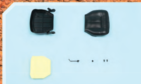
Front Left Seat